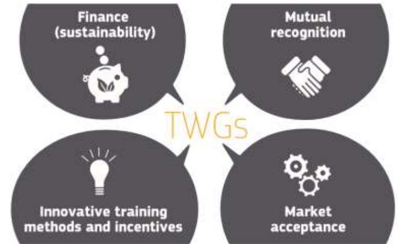
Technical Working Groups