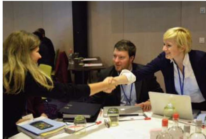
Peer Review Teams