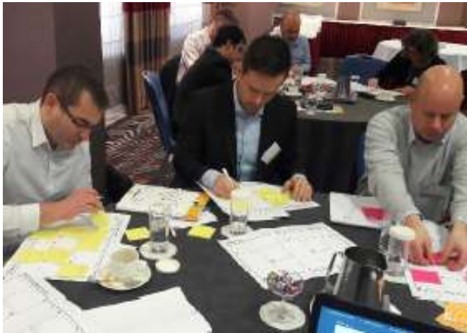
Exchanging on common challenges , sharing best practices