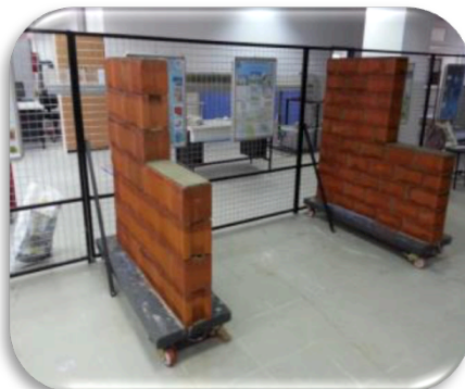
Interlaced bricks d=0.2 \lambda=0.118