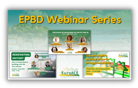
EPBD Webinar Series