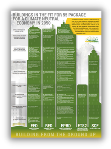
Fit for 55 Infographic