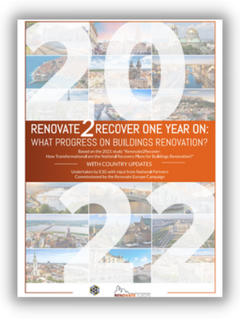
Renovate2Recover One Year On: What progress on building renovation