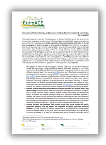
Renovation of historic, heritage, and protected buildings: Recommendations & case studies