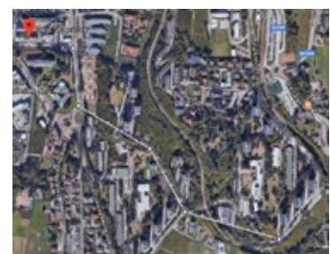
Figure 4 - Plausible route of the duct between the shopping centre and the towers under study in the Stardust project.

refrigeration units, 6570 system operation hours (from 6:00 to 24:00) and 30 °C as the water temperature out of the above-mentioned heat exchanger, in both scenarios the potential recovered heat could partially or totally meet the whole energy demand of the considered buildings (1200 MWh per year for 3 Towers) and the mismatch could be easily covered thanks to a possible additional geothermal field. Concerning the investments (if IRR = 5%), the pay-back time is about 8 years for the pre-insulated steel pipes hydraulic network serving the 1 km-far Towers. The PEAD pipes make this scenario's pay-back time increase up to more than 25 years (useful life of the system) because of the higher thermal losses and pressure drops corresponding respectively to lower energy savings for the Towers and higher operating costs. In the 400 m-far Towers scenario, the pay-back time is about 3 years for both piping types basically because of the shorter distance. The attraction towards this kind of investment can be even higher because incentives for energy efficiency improvement, as the national "white certificates" neglected in this analysis, could further reduce the pay-back time.