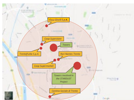
Figure 1 - Location of interesting activities for waste heat recovery in the Madonna Bianca area.

In order to identify the best heat recovery opportunities, the typical productive processes and the use of auxiliary devices have been studied within the above-mentioned sectors and, aiming at directly contacting energy/facility managers, a sector specific questionnaire has been prepared. The monitoring data of the refrigeration units of a shopping mall close to the Towers have been obtained through the survey whereas the other activities energy consumptions have been characterized reviewing articles and sector study reports.