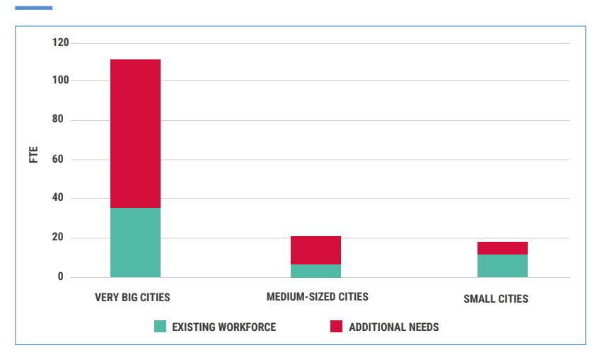
FIGURE 2. Average existing and required workforce working on building decarbonization in Polish municipalities according to their size